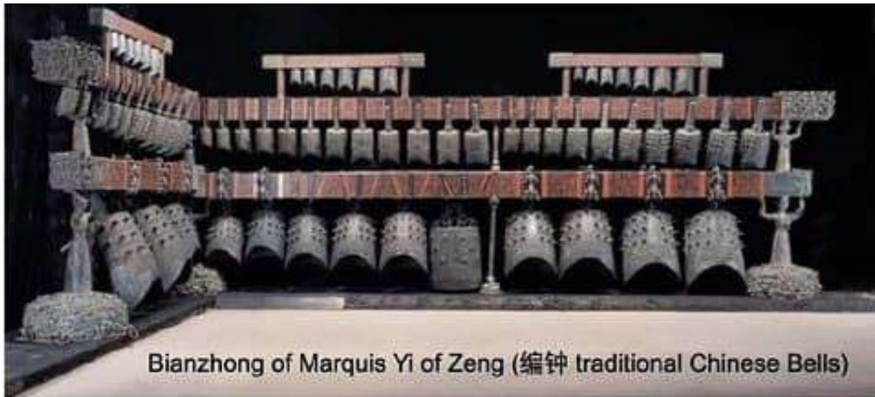
Bianzhong of Marquis Yi of Zeng (编钟 traditional Chinese Bells)