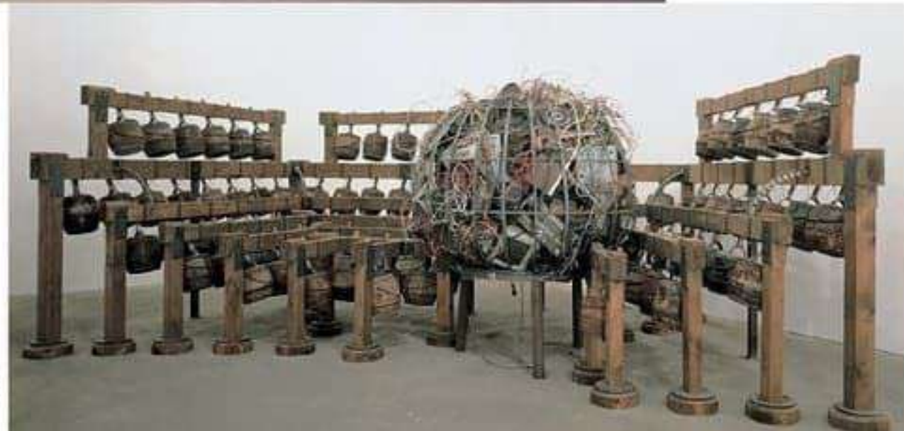
CHEN Zhen 陈箴 (1955-2000), Daily Incantations , 1996