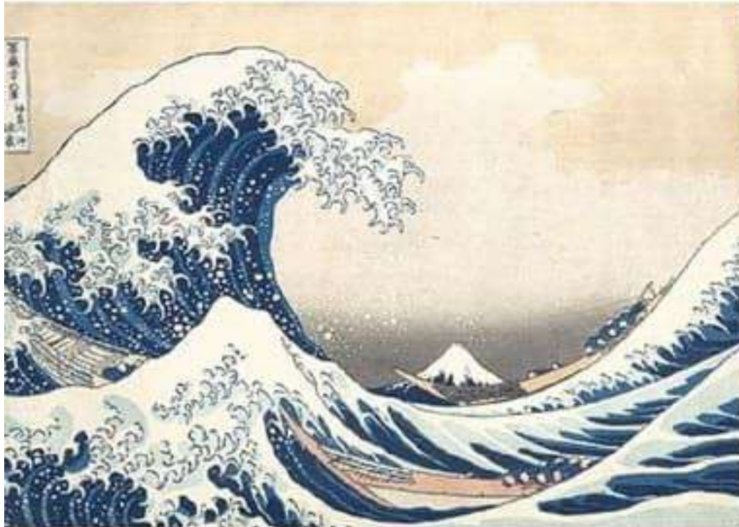
Katsushika Hokusai 葛飾北斎 (1760–1849) Thirty-Six Views of Mount Fuji - The Great Wave Off the Coast of Kanagawa, 1826-1833