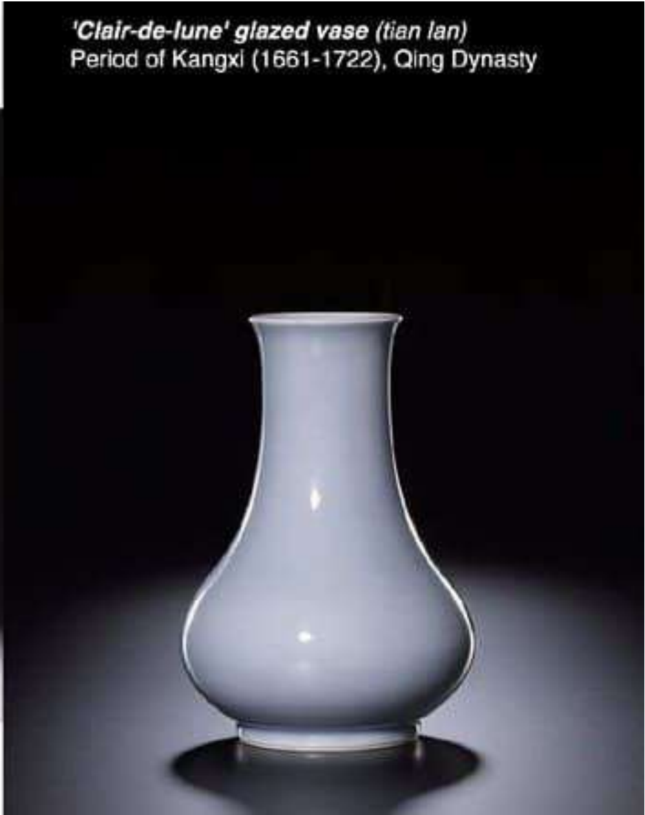
'Clair-de-lune' glazed vase (tian lan) Period of Kangxi (1661-1722), Qing Dynasty