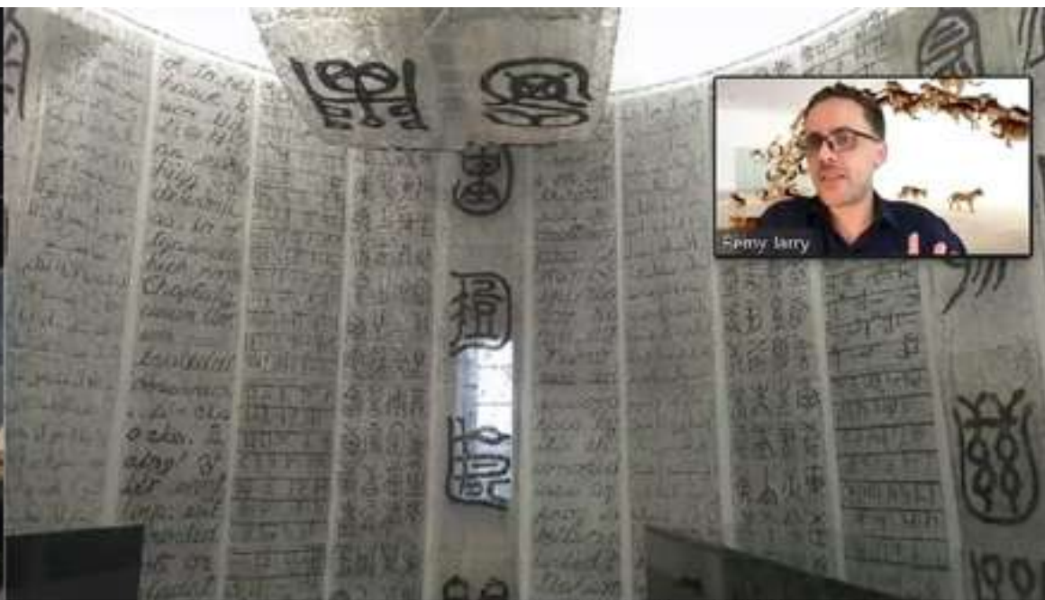
United Nations: Babel of the Millennium, 1999