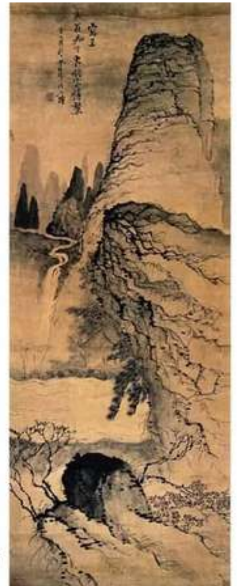
Shitao 石濤 (1642-1707), Pine Pavilion Near a Spring 《松閣臨泉》, 1675