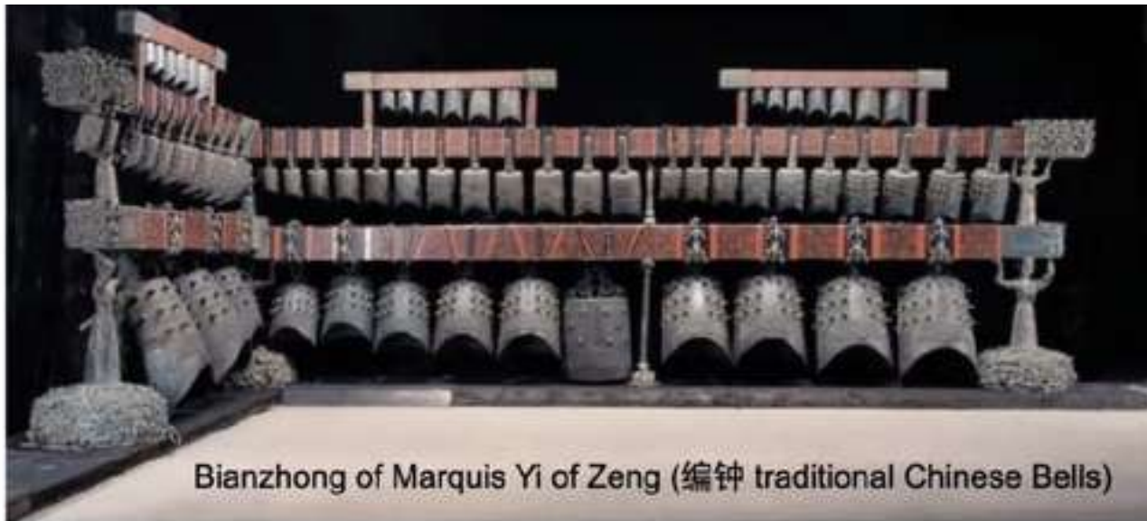
Bianzhong of Marquis Yi of Zeng (编钟 traditional Chinese Bells)