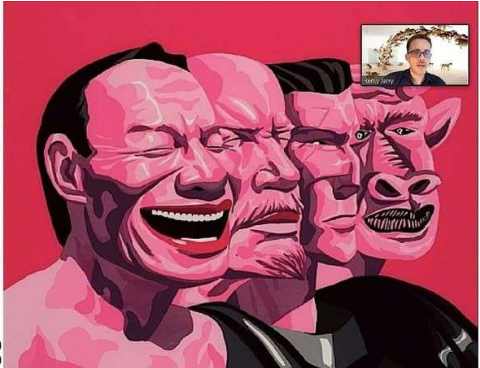
Yue Minjun 岳敏君 (1962-) Revolutionist , 2000