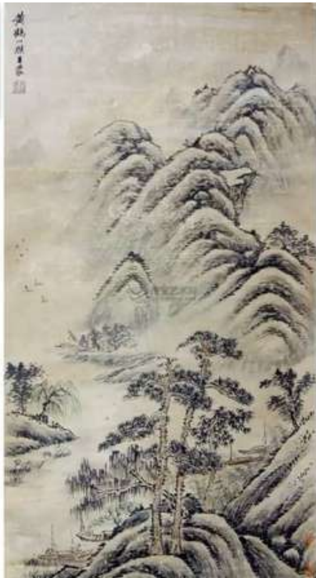
WANG Meng 王蒙 (c. 1301-1385) Landscape 《山水》