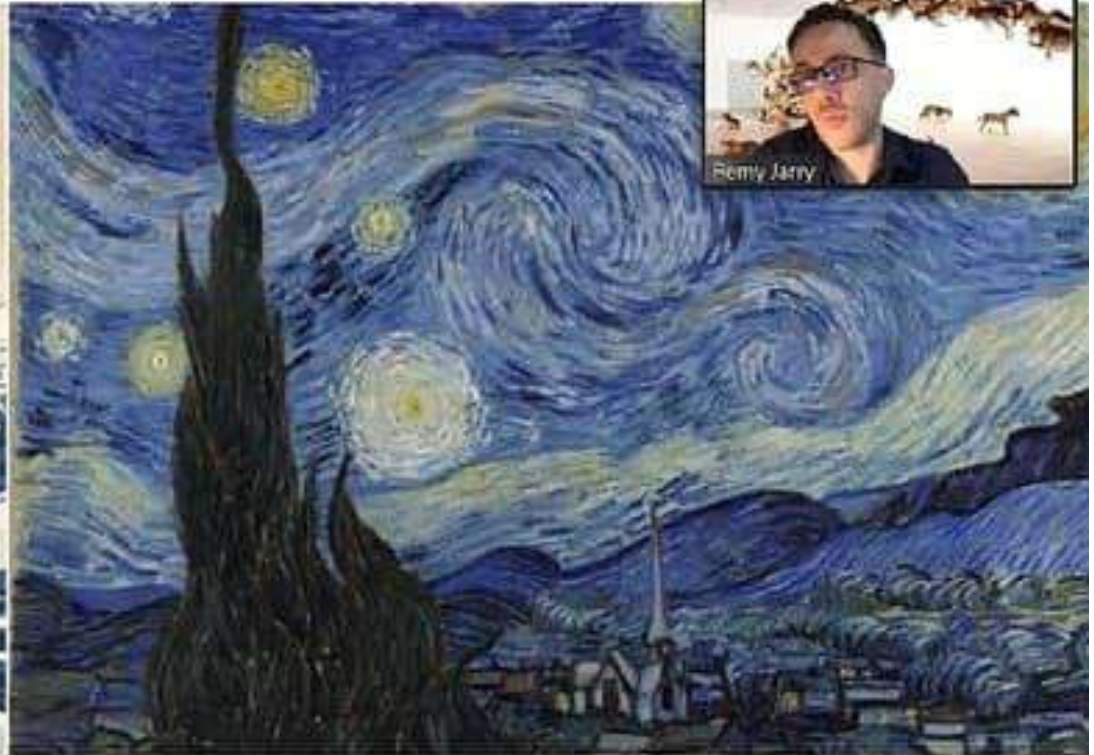
Vincent Van Gogh (1853-1890) Starry Night aka La nuit étoilée , 1889