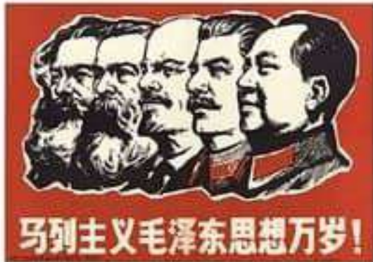
"Long live Marxism-Leninism-Mao Zedong Thought!" 1968