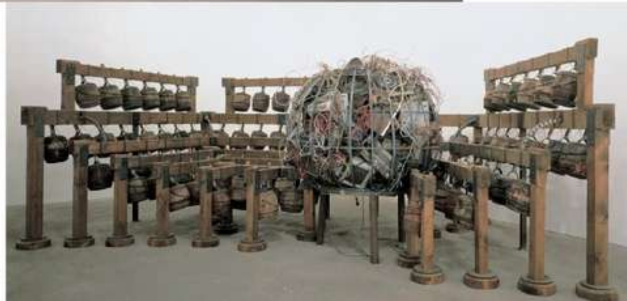
CHEN Zhen 陈箴 (1955-2000), Daily Incantations , 1996