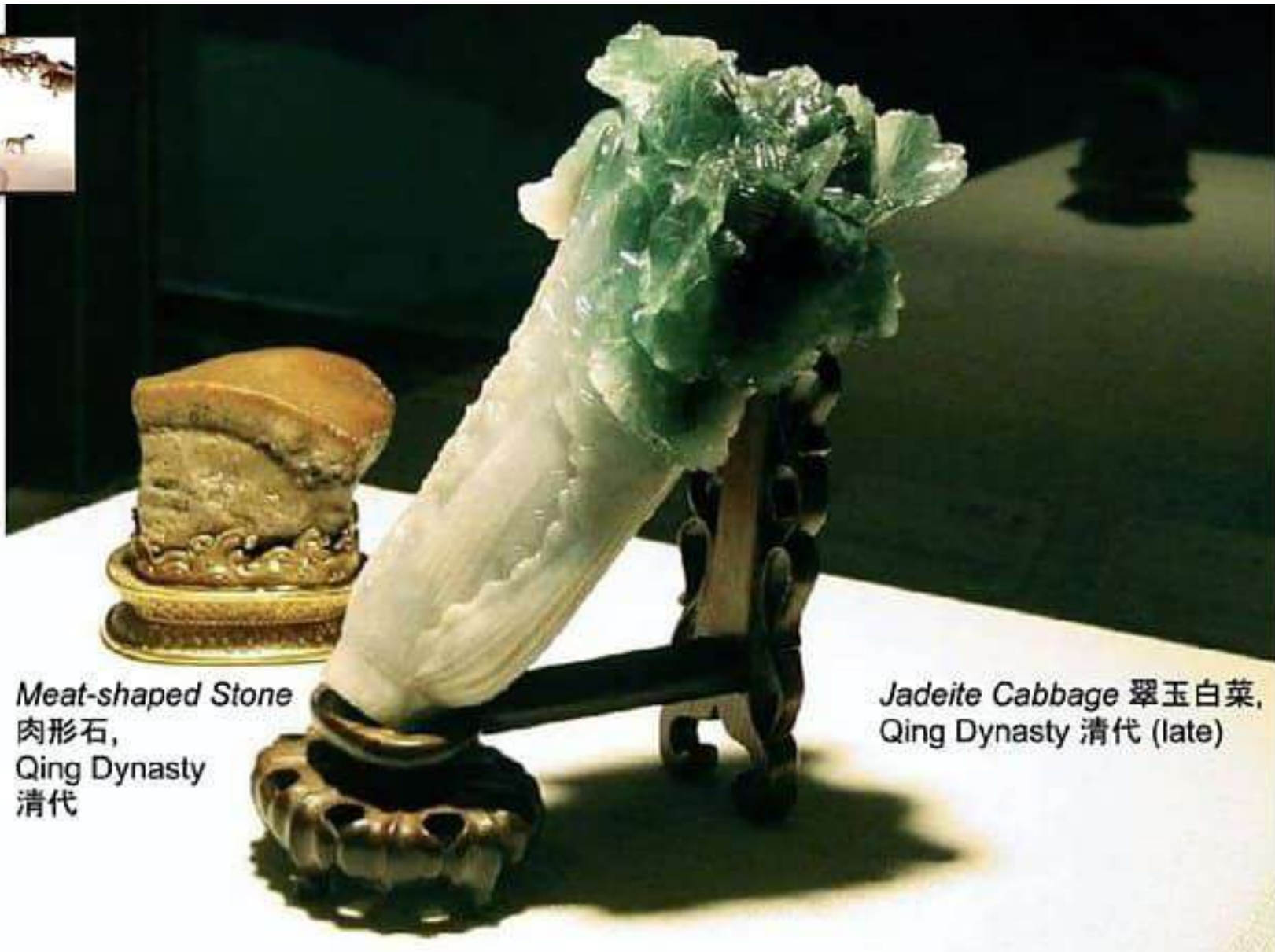
Meat-shaped Stone 肉形石, Qing Dynasty 清代